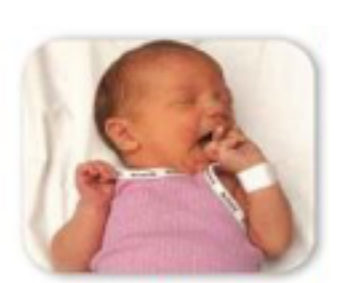
- Hand to mouth