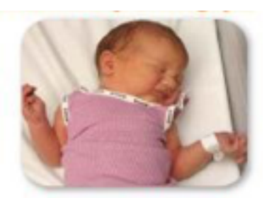
Increasing physical movement