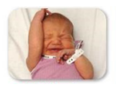
Agitated body movements